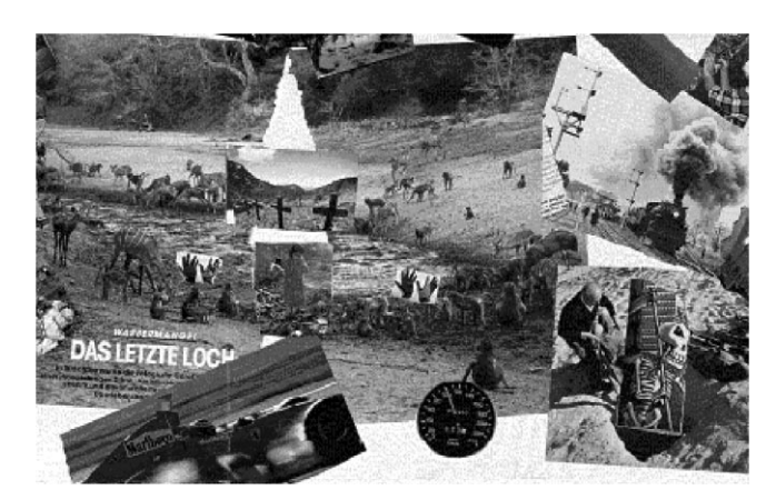
Fig. 1. Detail of a collage associated with a high-energy future (BAU-scenario).