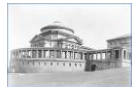
Gould Library, NYU

1930’s brought the first doctoral level training in school psychology. In the mid-1930’s, state department certification for school psychologists occurred in New York and Pennsylvania.