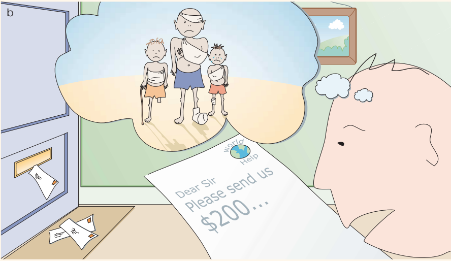
Figure 1 | Moral dilemmas and contradictions. People believe (a) that it would be deeply wrong to abandon a bleeding stranger by the side of the road in order to preserve one's leather car seats, but (b) that it is morally acceptable to spend money on luxuries when that money could be used to save the lives of impoverished people. Some philosophers have questioned these beliefs, arguing that our obligation to help the world's poor is as strong as our obligation to take a bleeding stranger to the hospital<sup>12,13</sup>. The author argues that neuroscience can help to explain why we have this pair of putatively inconsistent attitudes and that an improved understanding of these attitudes might lead us to change them.

allegiance, or are some more reliable than others? Our answers to this question will probably be affected by an improved understanding of where our intuitions come from, both in terms of their proximate psychological/neural bases and their evolutionary histories.