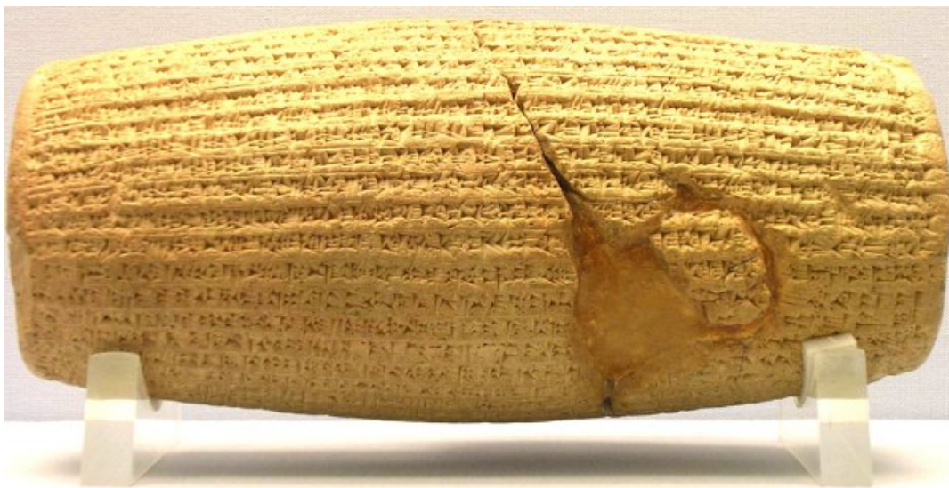
Cyrus the Great's Cylinder (now in The British Museum)

Cyrus The Great Cylinder Babylonian, about 539-530 BC This clay cylinder is inscribed in Babylonian cuneiform with an account by Cyrus, king of Persia (559-530 BC) of his conquest of Babylon in 539 BC and capture of Nabonidus, the last Babylonian king.